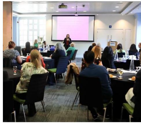
A guide for BMA elected members